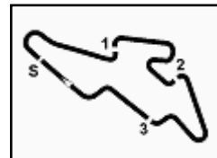
Automotodrom Brno 5.403 m